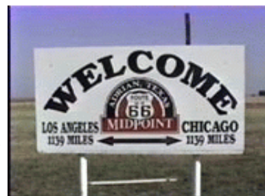
Mid Point Sign, Adrian, TX

Adrian, TX has plans to create a serious monument to Route 66's half way point. We learn that they've designed a more permanent structure than the much photographed sign.. They are selling bricks that will be incorporated into the structure. Construction is set for later this year. For info about the